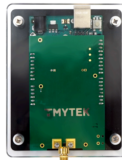
Figure 1. Photo of Power Detector